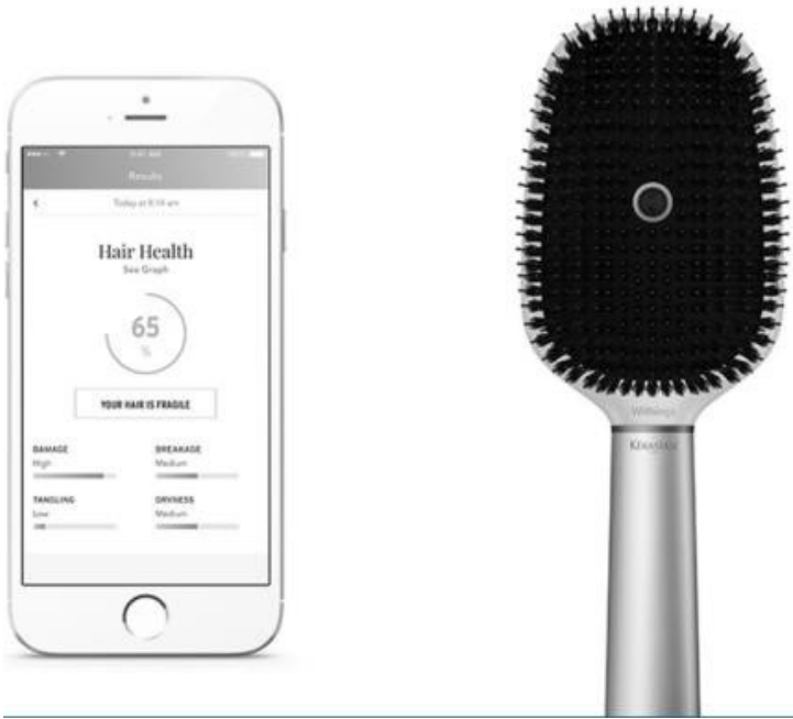
Fig. 1: Withings Kerastase smart hair brush and its Hair Health app.

Games such as a join-the-dots game [22] or card selection in game boards [23] can be exploited to gather assessment data. By measuring many parameters, including task completion time, latency time, mouse/pad/finger movements it is possible to evaluate the person's attention, executive functions, perception, and motor abilities, and compare them with reference performance values [24]. Monitoring user interaction with a digital game allows one to detect cognitive deficits. However if the user feels (s)he is undergoing a form of examination, this might impact on the results [20].